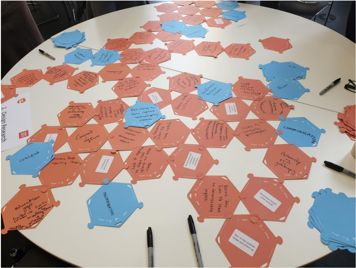
Figure 2 Mapping of challenges and clustering into themes during the workshop

The workshop took place at the Manchester Metropolitan University, where the IASDR 2019 Conference was hosted and it involved 8 participants with expertise in conducting design research in the Global South.